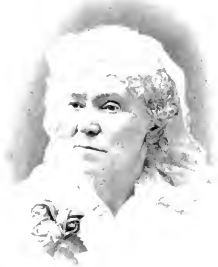
MATILDA JOSLYN GAGE.